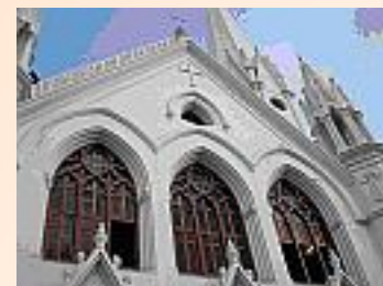
San Thome Cathedral, Mylapore, Chennai